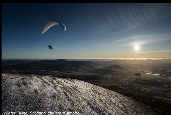
Winter Flying, Scotland. @KieranCampbell

“Winter brings fresh and smooth flying conditions, or the opportunity to travel south to search for big XC. Maintaining currency, if only with short but regular sessions are essential to be ready for spring’s thermic energy.”